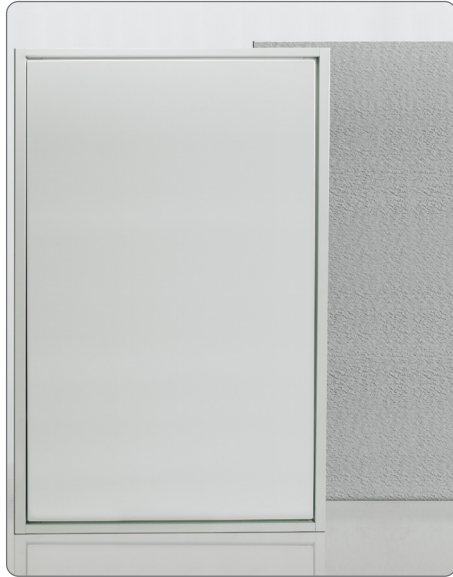
Decorative Wall Panel & Closet Panel