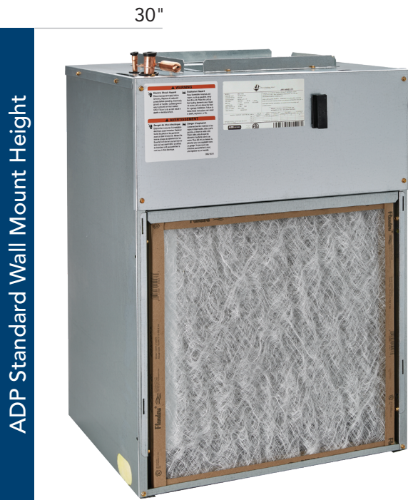
30" tall for heat pump match-ups (35" option also available)

ADP provides options for a variety of applications to meet industry needs.