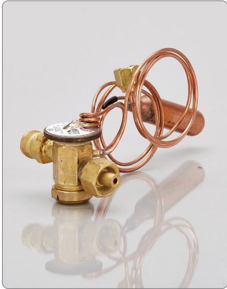
TXV with all threaded connections