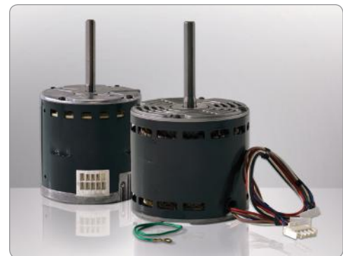
High efficiency 5-speed ECM motor: 208/240V Electric Heat and No Heat Models Only