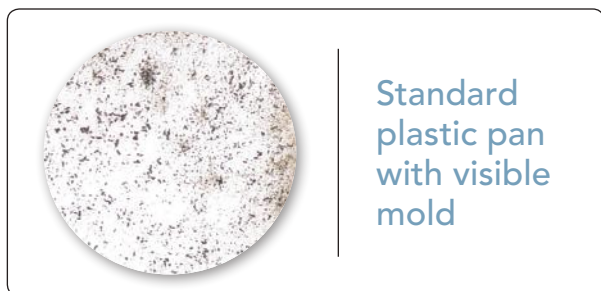
Standard plastic pan with visible mold

Microbes can double every 20 minutes on an untreated surface!