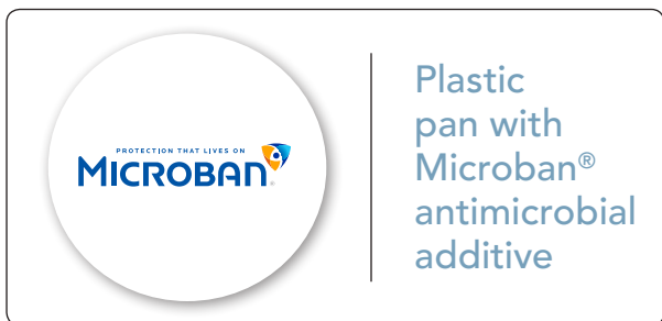
Plastic pan with Microban® antimicrobial additive

Mold is part of our environment and there are no practical ways to completely eliminate mold spores.