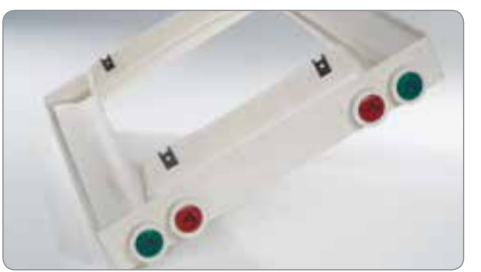
Patented HydroTEC<sup>™</sup> low water retention drain pan

Dual drain connections on each side for ease of installation