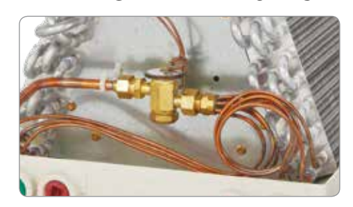
TXV with all threaded connections saves time in the field