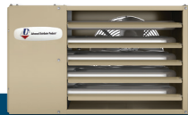
Compact Unit Heaters