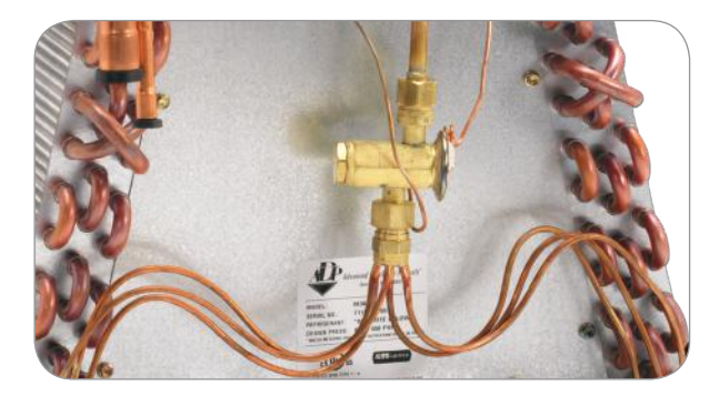
TXV with all threaded connections saves time in the field; no brazing required