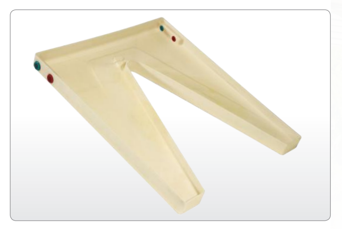
Patented HydroTEC™ "V" shaped drain pan directs water to front of the pan and away from furnace flue connection

Dual drain connections on each side for ease of installation