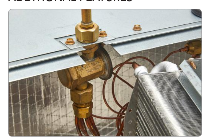
TXV with all threaded connections saves time in the field