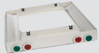
Green & red drain pan plugs to identify primary vs. secondary