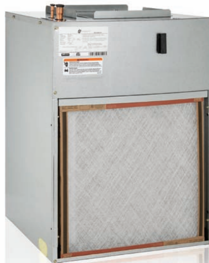
S Series Wall Mount Air Handler

The ADP advantage becomes clear when comparing our 5-Year coverage to other brands of hydronic and wall mount air handlers that only offer a 1-Year warranty.