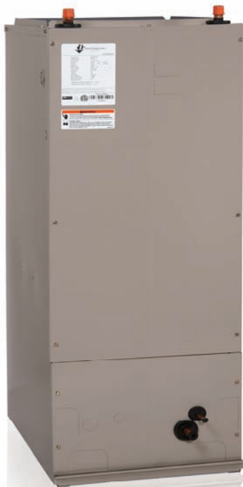
B Series Hydronic Air Handler