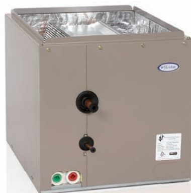
HE Series Premier Coil Collection