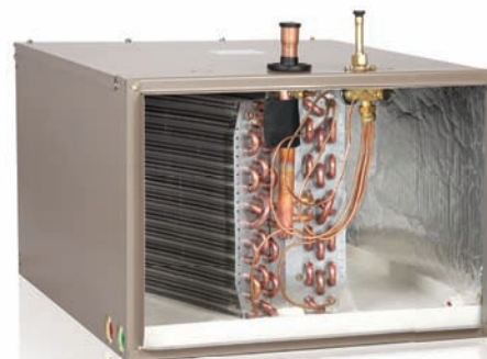
V Series Premier Coil Collection

Healthy Solutions® products, a premier upgrade for any system, feature an available 10-year limited warranty.