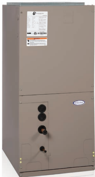
F Series Compact Air Handler